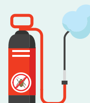
Fumigants: Methyl Bromide