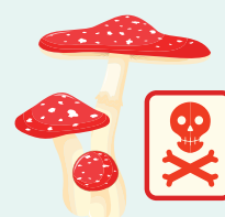
Fungicides: Calcium Polysulfide, Captafol and Captan