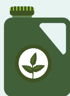
Herbicides: Glyphosate, Paraquat and Diquat